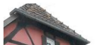
Hip roof Halbwalm

The numbering of the wooden elements would make it possible to reconstruct the buildings after disassembly.