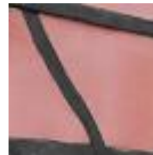
Discharge Beam Strawe