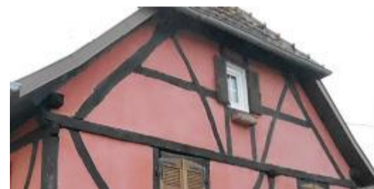
Surplus Attic Kniestock