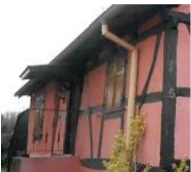
Gutter wall Kandelwür

Small architectural lexicon English/Alsatian