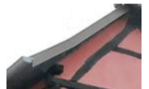
Coyau ≈ Eaves Leischte